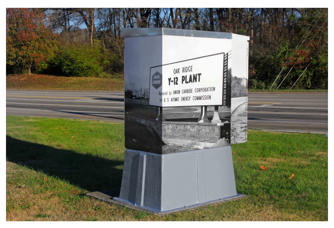
At the corner of Scarboro Road and South Illinois Avenue