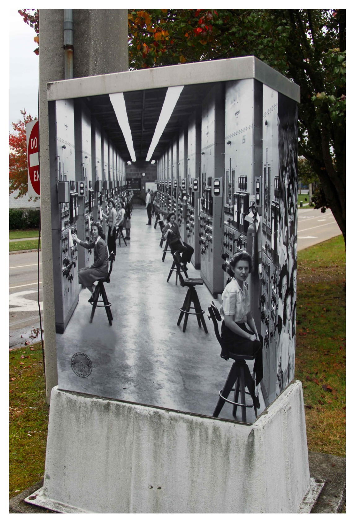
At the corner of Tulane Avenue and the Oak Ridge Turnpike